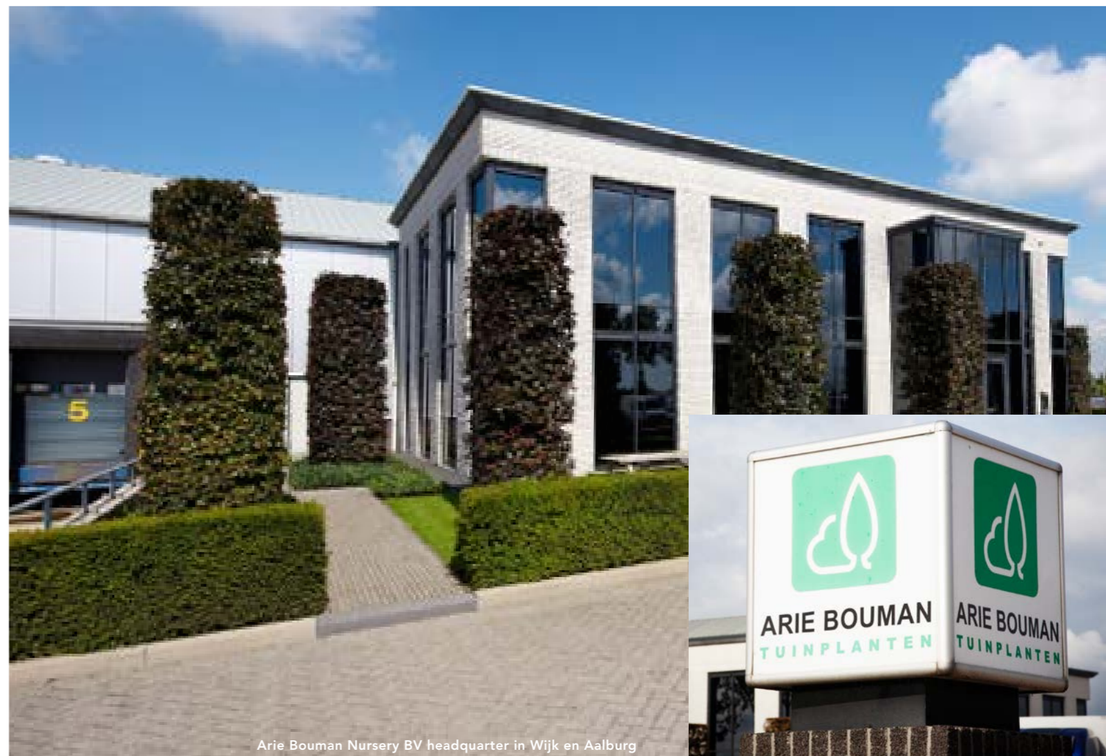
Arie Bouman Nursery BV headquarter in Wijk en Aalburg