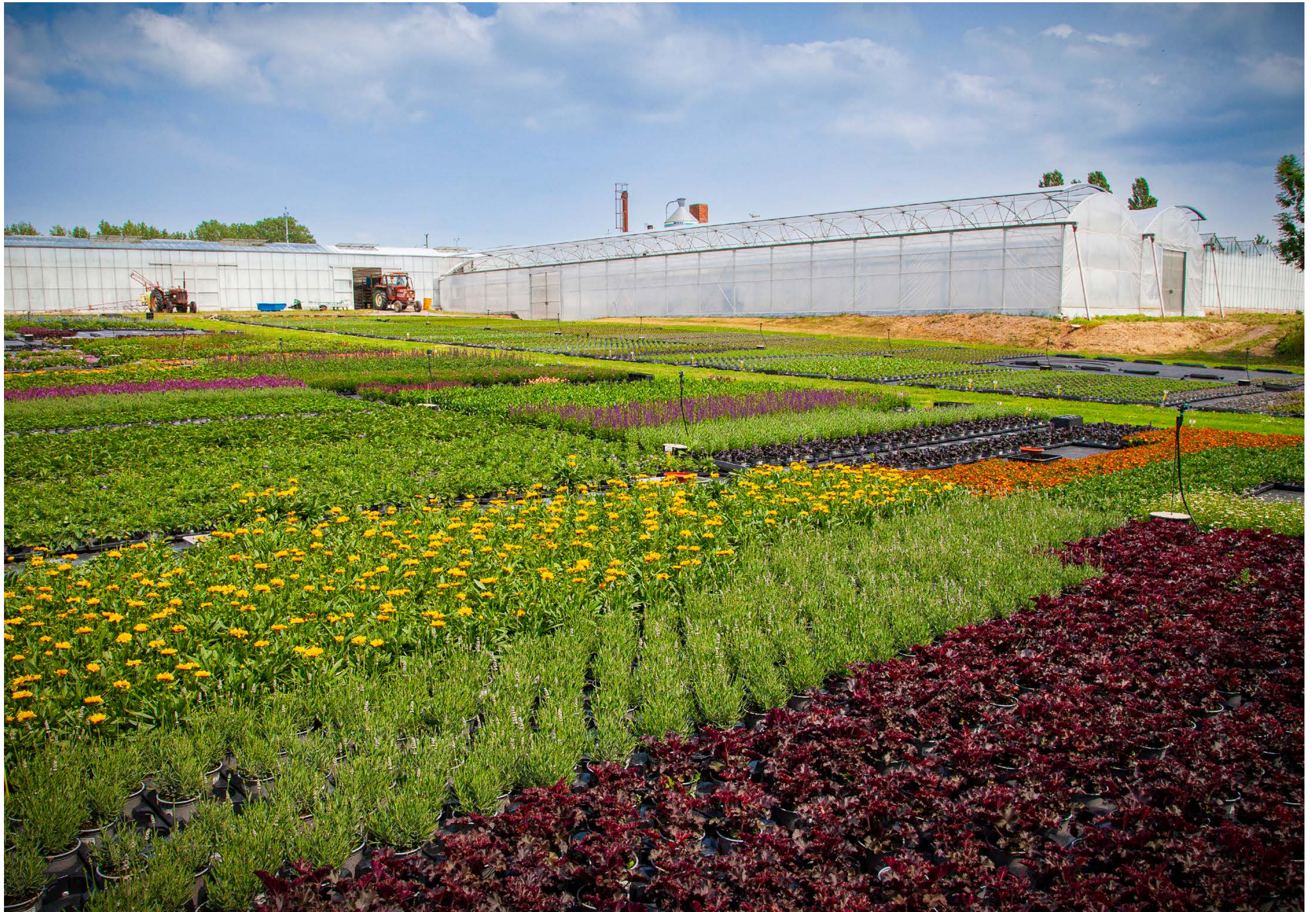
Inгла Blommor, just outside Billeberga, has 5,800 m 2 of greenhouses and tunnel cultivation adapted for spring and summer cultivation, as well as 4,000 m 2 of outdoor cultivation.