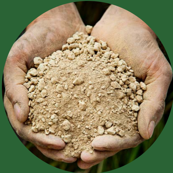
Bara Clay Calcium Plus