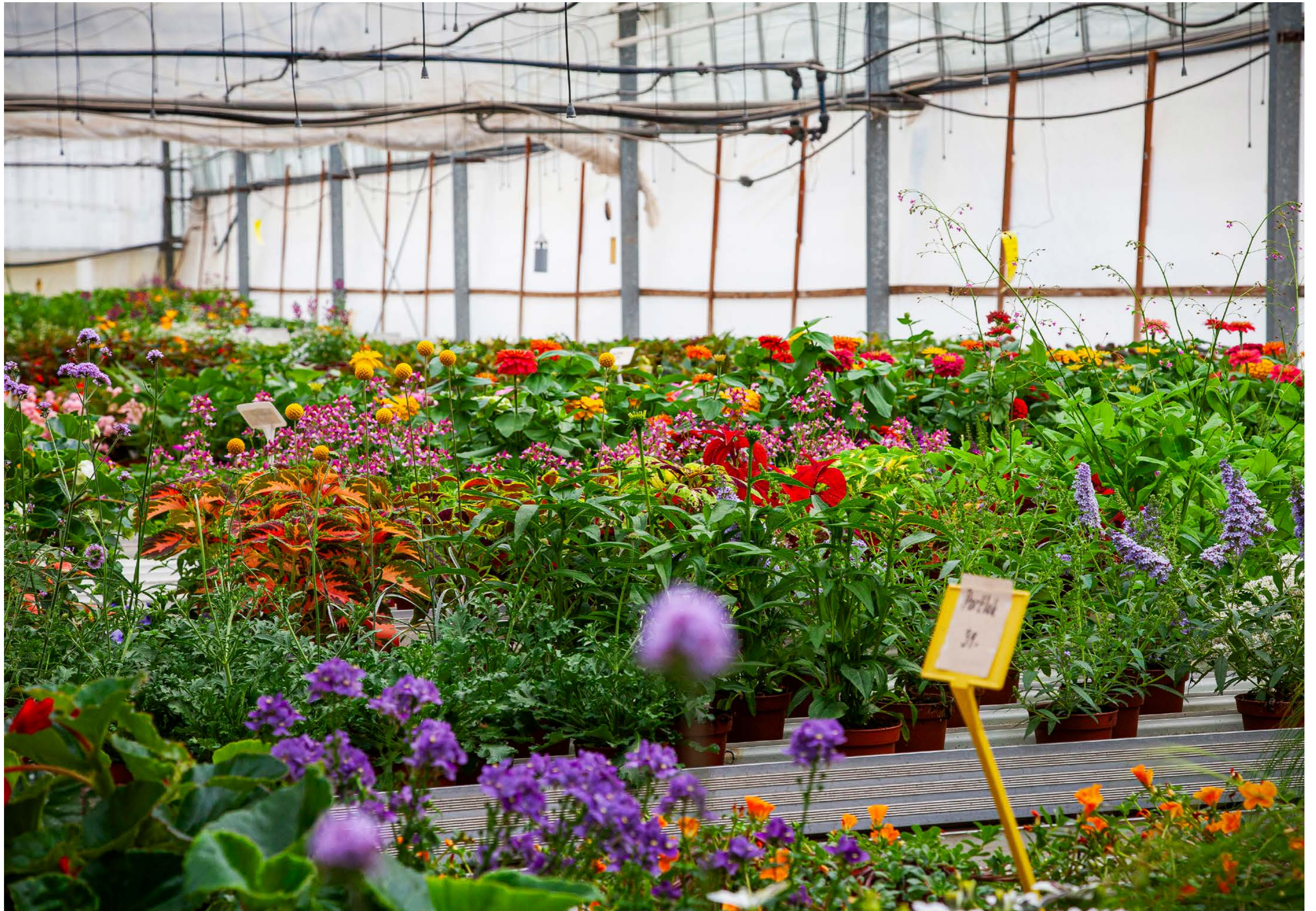
Jakobssons handelsträdgård is located near Helsingborg, and there is a high influx of private customers buying tulips in the spring, continuing with summer flowers throughout the season.